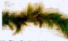
White Pine Roping 25 Feet