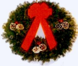
21" or 36" Outside dimension Decorated or Undecorated