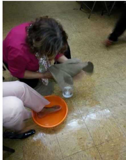
Maundy Thursday Services