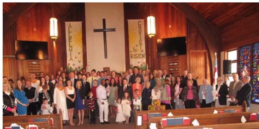
Easter Sunday Services