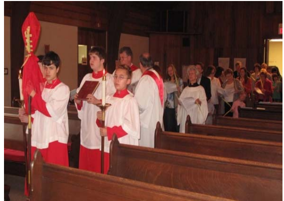
Palm Sunday Services