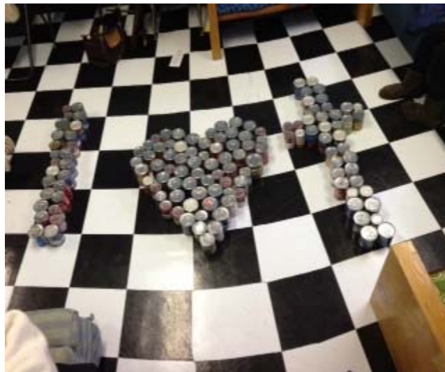
St John's creative collection

Due to the snow, we needed to reschedule both our "Soup"er Bowl pick-up and tour of the Center for Food Action as well as our Tri Parish Council Meeting - both are rescheduled for next Monday the 10th.